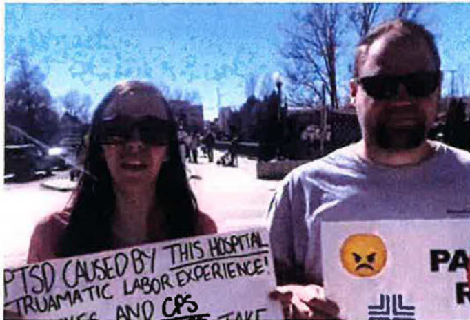
Figure 5: #342 and wife