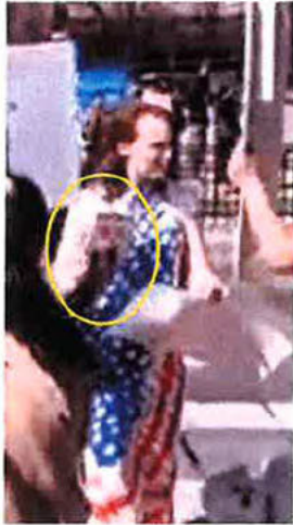
Figure 2: Protestor handing out Wanted Posters